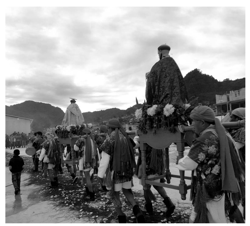
TRANSPORT OF IMAGES IN THE TZOTZIL COMMUNITY OF ZINACANTÁN, CHIAPAS.

The purpose of this text is precisely to stop and take a look at some examples that expose this complexity and reveal part of a mutual confusion of the community representatives and the specific representatives of the governmental cultural institutions. I would also like to point out that, although conservation-restoration in Mexico has managed to accommodate the demands and rights of many social groups in the decision-making processes of intervention —mainly in cases of direct possession of venerated objects and heritage spaces—, we have not yet managed to develop an in-depth understanding of the multiple meanings that communities give their sacred objects and to plan conservation treatments accordingly. One reason for this is that we generally try to apply, as it is still occurring in the rest of the world, deontological concepts that do not correspond to the purpose of their use and function within the group. Also, most of the time we forget that what is sought during the festivities and offerings that involve these objects, is to generate, not only relationships with some or multiple deities, but, above all, processes of community intersubjectivity (Magazine, 2015).