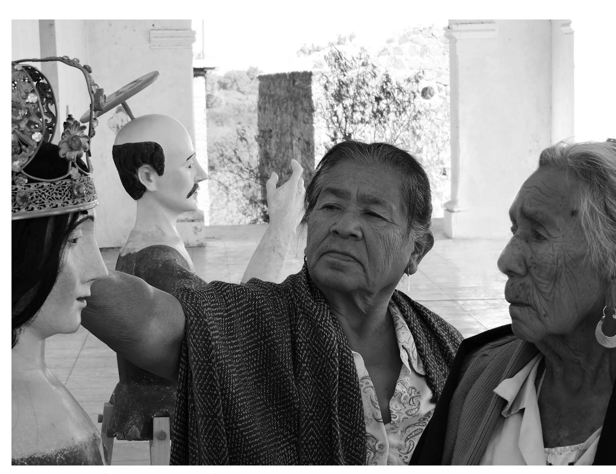
YAQUI KILLOSTES (MAIN MAYORDOMAS) DURING THE PRESENTATION OF RESTORED OBJECTS IN THE VILLAGE OF TÓRIM, SONORA.

In Tórim, finally, when the images are veiled and taken out in procession on the day of their respective patron festivity, they are also decorated with perfume. They are decorated because Jesus and the saints in heaven appreciate and look at the perfume, being a spiritual essence. However, they have already suffered two small fires caused by the presence of candles and the alcohol in the perfume. As they know that this is the reason for long conversations with the aim of trying to dissuade them from the act of adding perfume to the image, they simply hide it from us. Are we really a kind of police to whom "reprehensible" acts are hidden? (Is INAH the heritage police in Mexico? What are we communicating wrongly so that the consultation systems in the end do not seem to be so? What should we attend to, what should we modify in our protocols, what new alternatives can we generate between both sides?).