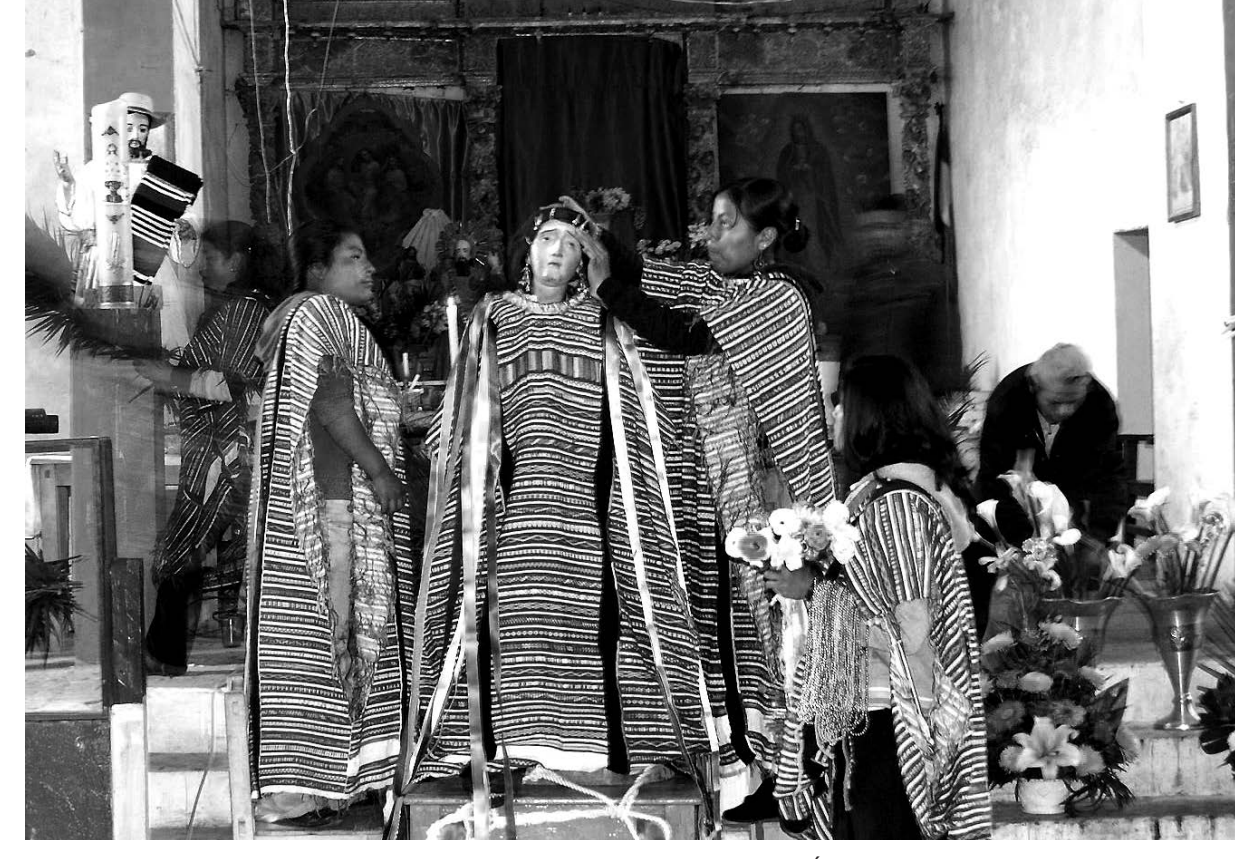
GROUP OF TRIQUI MAYORDOMAS¹ DRESSING A SCULPTURE IN SAN ANDRÉS CHICAHUAXTLA, OAXACA.

Although not always successful, in terms of institutional programs this great step obeys both the democratization of the country (which allows the freedom of speech, the participation of social organizations, public consultation, etc.), as well as a international theoretical discourse that emerged in international circles that largely generates, encourages, studies and supports the implementation of measures of this kind roughly for the last forty years.