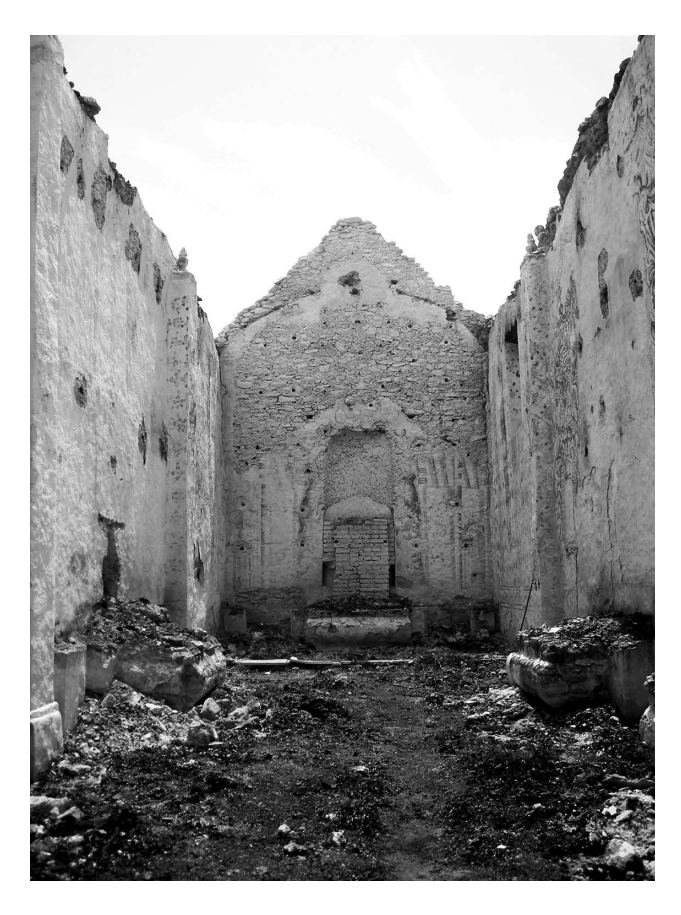
INTERIOR OF THE TEMPLE OF SANTA MARÍA ACAPULCO IN JULY 2007.