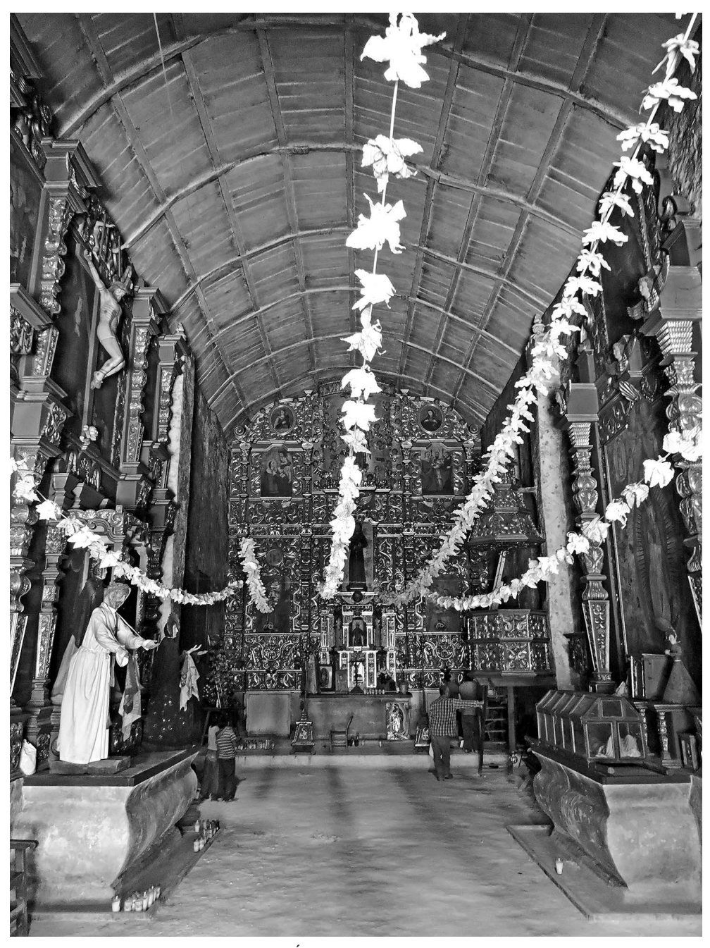
INTERIOR OF THE TEMPLE OF SANTA MARÍA ACAPULCO IN AUGUST 2014.