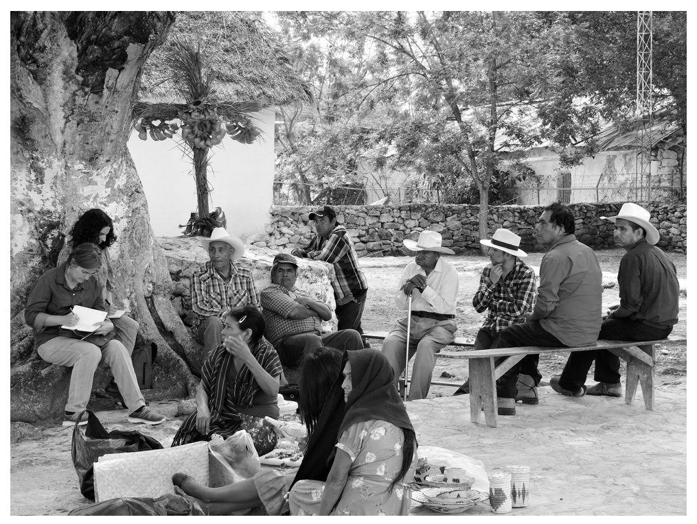
COMMUNITY MEETING, SANTA MARÍA ACAPULCO.

INAH's first projects were totally experimental and as a result, included many errors of very different types (fortunately, material can be rescued from them to show very relevant aspects of the way in which the Mexican state and the cultural practices of indigenous people in the country colide, so they are not necessarily useless efforts). 4,5