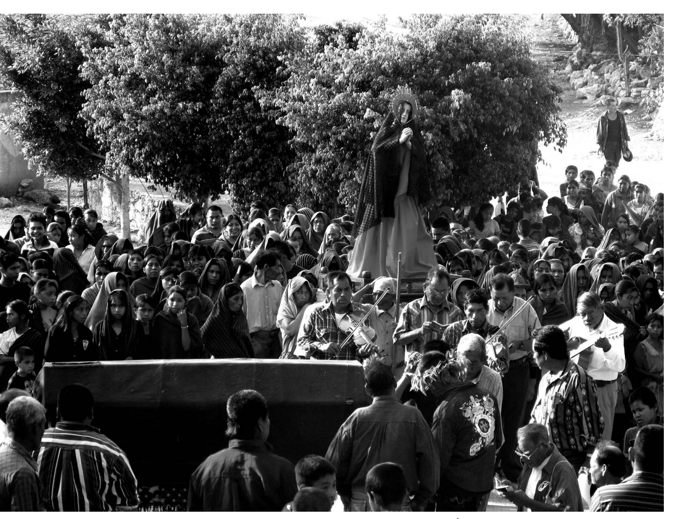
PROCESSION OF OUR LADY OF SORROWS IN SANTA MARÍA ACAPULCO.