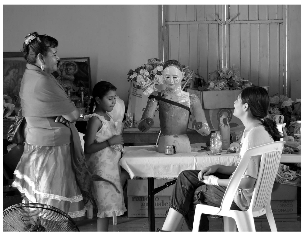
VISIT TO A PROVISIONAL AREA FOR RESTORATION WORK IN THE VILLAGE OF TÓRIM, SONORA.

There are already several proven lines of action that allow us to speak of satisfactory intervention treatments: short but repeated intervention treatments during seasons of field work that allow us to "take the temperature" and measure the effectiveness of the interventions, encourage a high level of ethnographic research, verify the religious cycles and the use in them of the objects and of architectural decorative elements, promote community assemblies as much as possible while remaining independent of the internal debates and specific decisions of each community, etc.