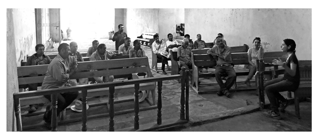
MEETING TO DISCUSS THE REPRODUCTION OF THE MAIN BELL AT MESA DEL NAYAR, NAYARIT.

Another example: from 2015 to 2017 the canvases and sculptures of the temple of the Holy Trinity of Mesa del Nayar were treated. The community, moreover, expressly asked us for help in the preparation of an inventory of the temple's collection, which had to be delivered together with the images treated for their conservation. We believed that the community sought to protect itself from potential future thefts, now that a paved road communicates its inhabitants with Tepic, the state capital. During the planning of a meeting on the appropriateness of reproducing one of the temple bells, several members of the council of elders and the communal property commissioner insisted on the need for the archaeologist who would register the sacred sites located in the lands of the community, to be present in the decision-making about the possible reproduction of the bell. The archaeologist could not be present during the meeting and the disappointment was evident. We are perplexed: what does a broken bronze Colonial bell have to do with the sacred sites of the non-Catholic cycle of Náayarite life?