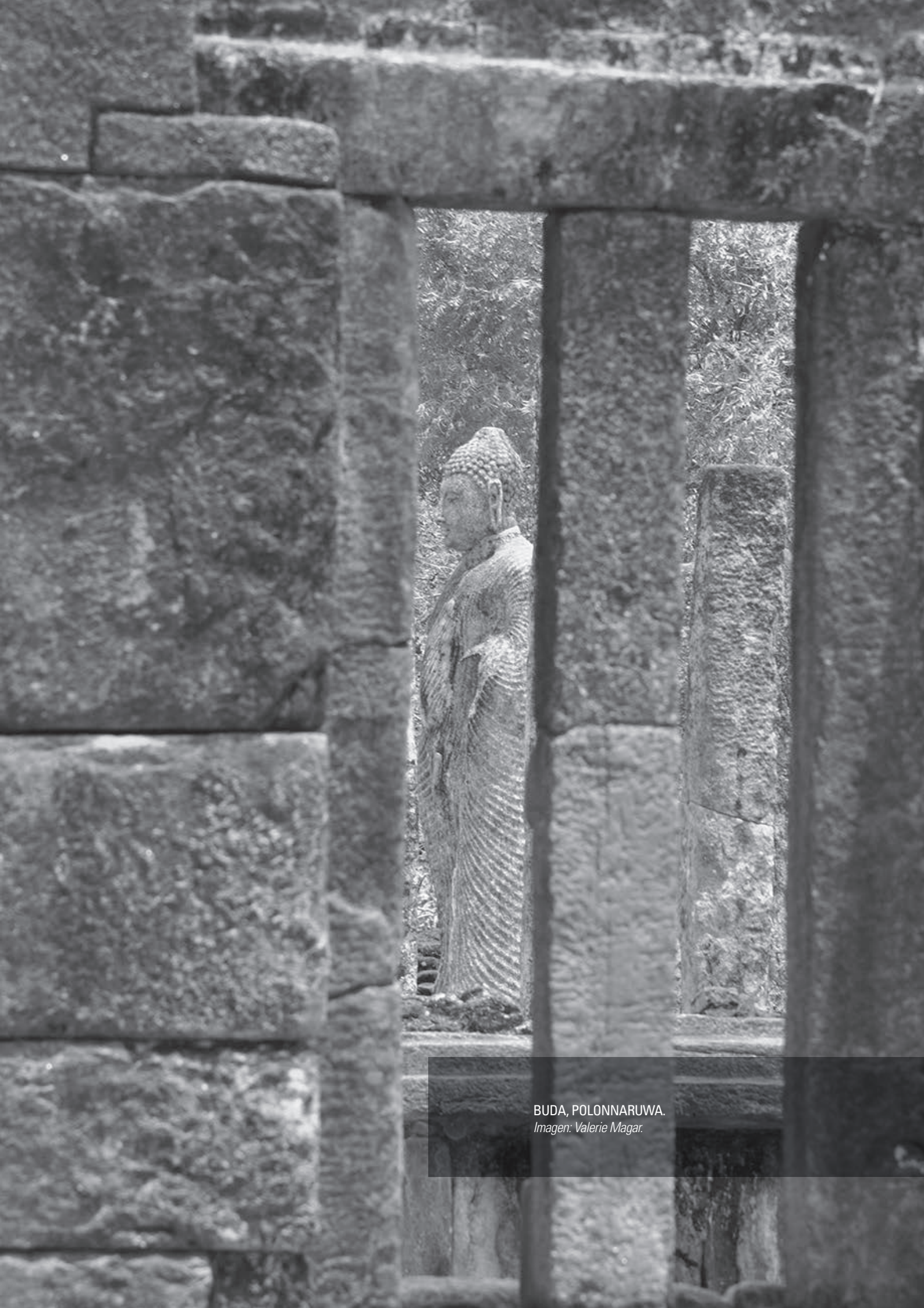
BUDA, POLONNARUWA.