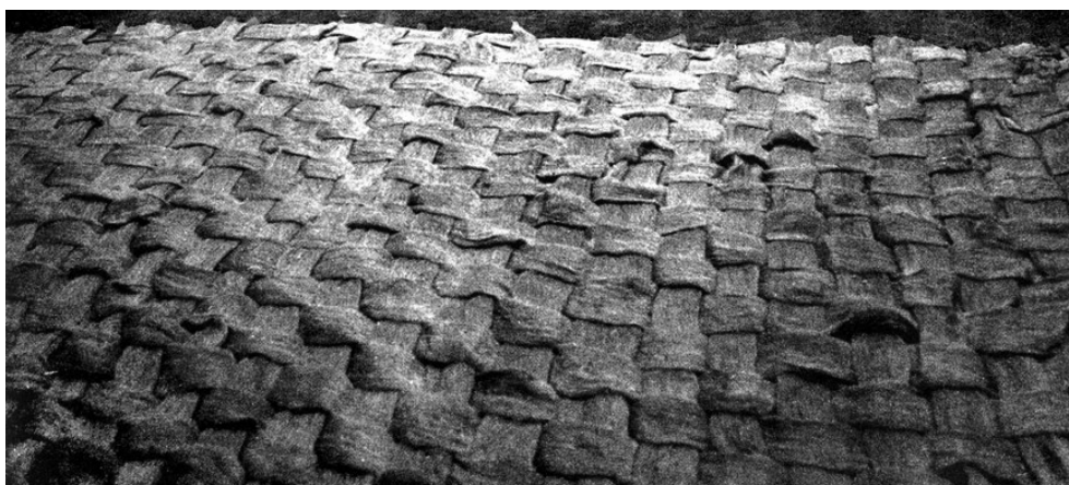
PENELOPE'S WEB. Pascal Pino, 1968.

From a theoretical and philosophical point of view, the difference that Massimo Carboni established between traditional art and contemporary art is very pertinent. It is something he calls: "the work of contingency, since much of contemporary art alludes to, in the very act of presenting itself, to its own disappearance, to an intentional and irremediable expiration" 26 (Carboni, 2014: 9). However, there are cases where the difference between the durability of the material and the materiality of the work of art, in Brandi's sense of the material as a vehicle for the epiphany of an image, imposes a more complex conservation and an interpretative choice. In relation to arte povera we often find materials that have rapidly weathered, as is the case, for example, of La tela di Penelope , by Pino Pascali (1968) in the Galleria Nazionale d'Arte Moderna , Rome, which after being exposed for several years, presented a state of oxidation of wood brushes that did not allow its continued exposure. As Professor Valentini 27 mentioned "Maybe the material of Pascali's work is not in those specific scrub brushes, but it's the idea itself of the canvas" (Valentini, 2008: 78).