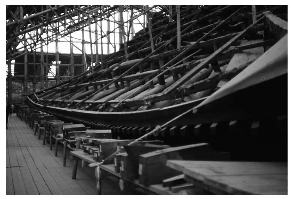
RESTORATION OF WOODEN TEMPLE. Fearing that World Heritage nominations would be judged within Eurocentric frameworks, the Japanese were also concerned that existing widespread conservation practices –such as the top-to-bottom periodic dismantling and reassembly of significant religious structures– would also be misunderstood by Western evaluators.

The Nara discussions also laid to rest a number of long-standing technical delusions that had limited the possibility to use authenticity in practical ways to guide decision-making.