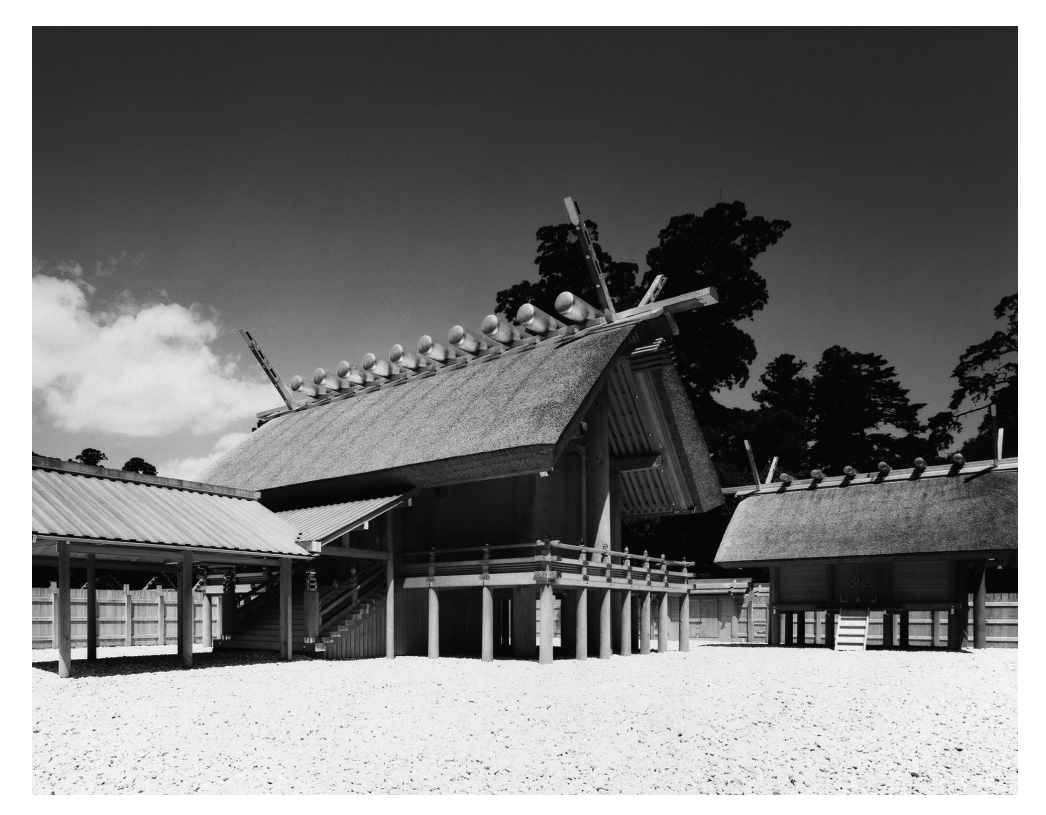
ISE SHRINE. One of the sources of the Nara meeting was the feeling of Japanese conservation professionals that their approaches to conservation were misunderstood. The example most cited was the false contention in many Western publications that the Japanese ritually rebuilt replicas of their temples on adjacent sites every twenty years -a practice in fact limited in modern times to one Shinto shrine, the lse Shrine, seen here.

all judgments about values attributed to cultural properties as well as the credibility of related information sources may differ from culture to culture, and even within the same culture. It is thus not possible to base judgements of values and authenticity within fixed criteria. On the contrary, the respect due to all cultures requires that heritage properties must be considered and judged within the cultural contexts to which they belong (Nara document, 1995: xxiii).