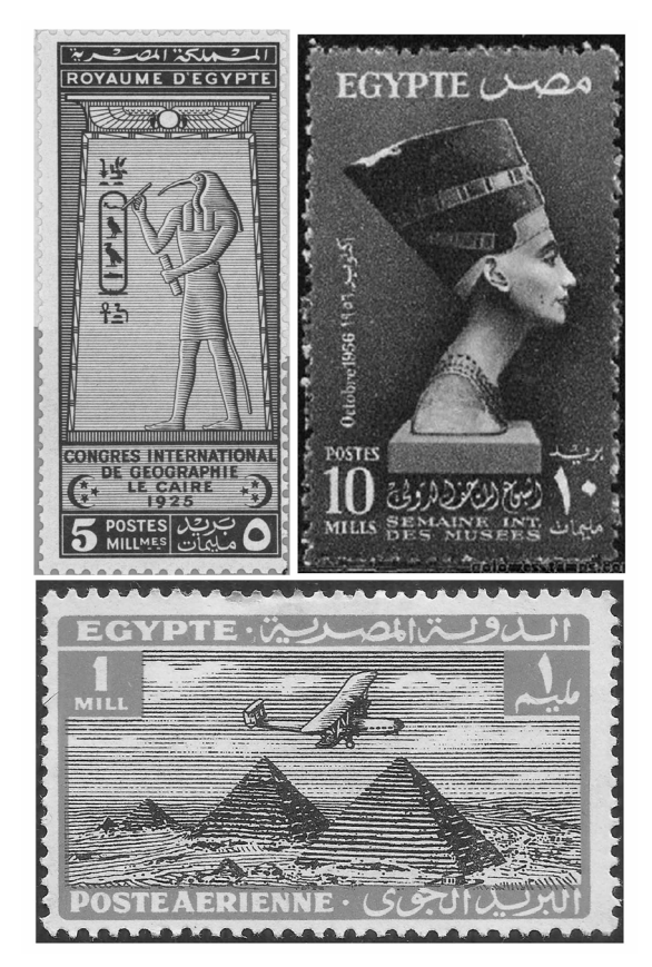
POSTAL STAMPS USING PHARAONIC HERITAGE. Images: Public domain.

Modern Arab national identities are represented by the archaeological remains of each Arab nation state. Postal stamps, banknotes, coins, and other representations of nations' sovereignties were and continue to be adorned by images of ancient ruins (Reid, 2015: 360). Furthermore, revivalist architectural styles are often chosen for public buildings. Statues representing ancient heritage were erected in important public spaces. Restorations and reconstructions of ancient ruins are carried out to ensure the grandness of the ancestors of different Arab nations (Reid, 2002; 2015; Mahdy, 2017).