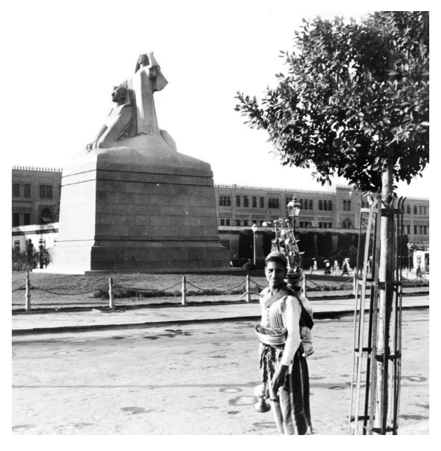
AWAKENING OF EGYPT, BY MAHMOUD MUKTAR, CAIRO.

Arab national movements during the colonial period as well as national governments after independence followed the European 19<sup>th</sup> century example by establishing their national identity based on their ancient history (Bernhardsson, 2010: 61-62). They further followed the European example of using ancient ruins as the material evidence and visual representation of the historicity and authenticity of their newly established national identities (Reid, 2002; 2015).