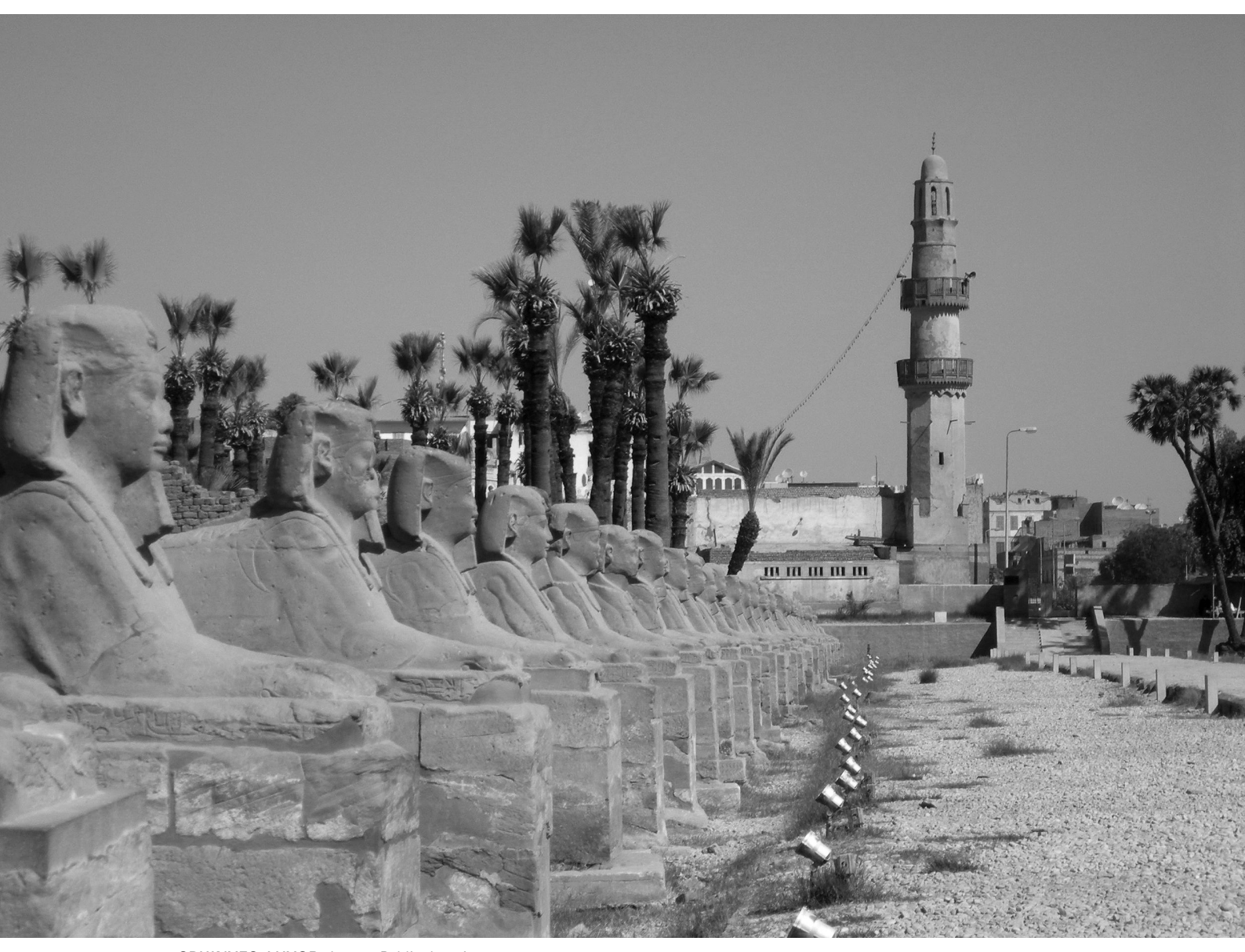
SPHINXES, LUXOR.

of ancient ruins with little or no consideration for the authenticity of their fabric. Since 2014 and up to the present, General Sisi of Egypt has been relocating and reconstructing obelisks, sphinxes, and other Ancient Egyptian artifacts and architectural elements to serve the image of a proud nation state with glorious past.<sup>11</sup>