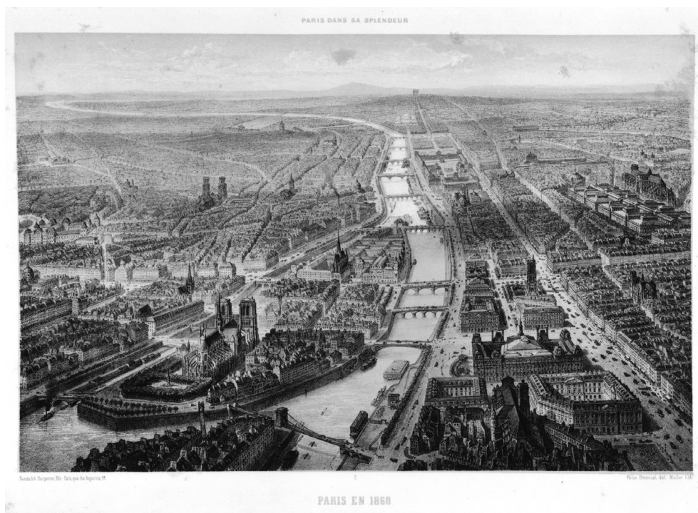
FIGURE 1. PARIS IN 1860. Philippe Benoist’s bird’s eye view of Paris, midway into the prefect’s tenure, captures the coexistence of conservational and transformational impulses in Haussmann’s program.