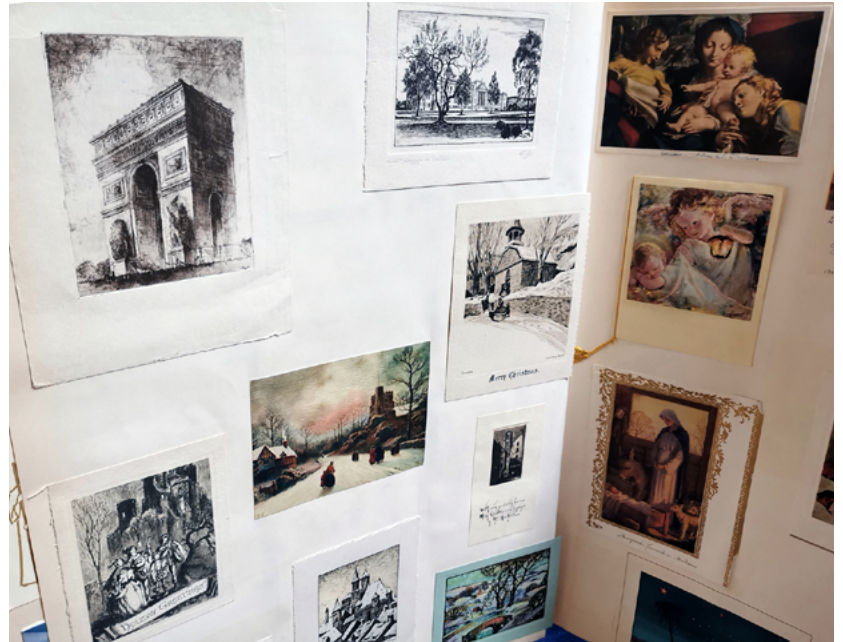
FIGURE 3. Example of engravings and participations among the miscellaneous of albums of the BRBA.

While it could be said that this collection responds to interests merely linked to the Catholic Church, this extensive collection has in fact a wide variety of photographs that portray all kinds of characters from political and cultural life and, in general, from San Luis Potosí's society and old places and buildings from different cities in San Luis Potosí, Mexico.