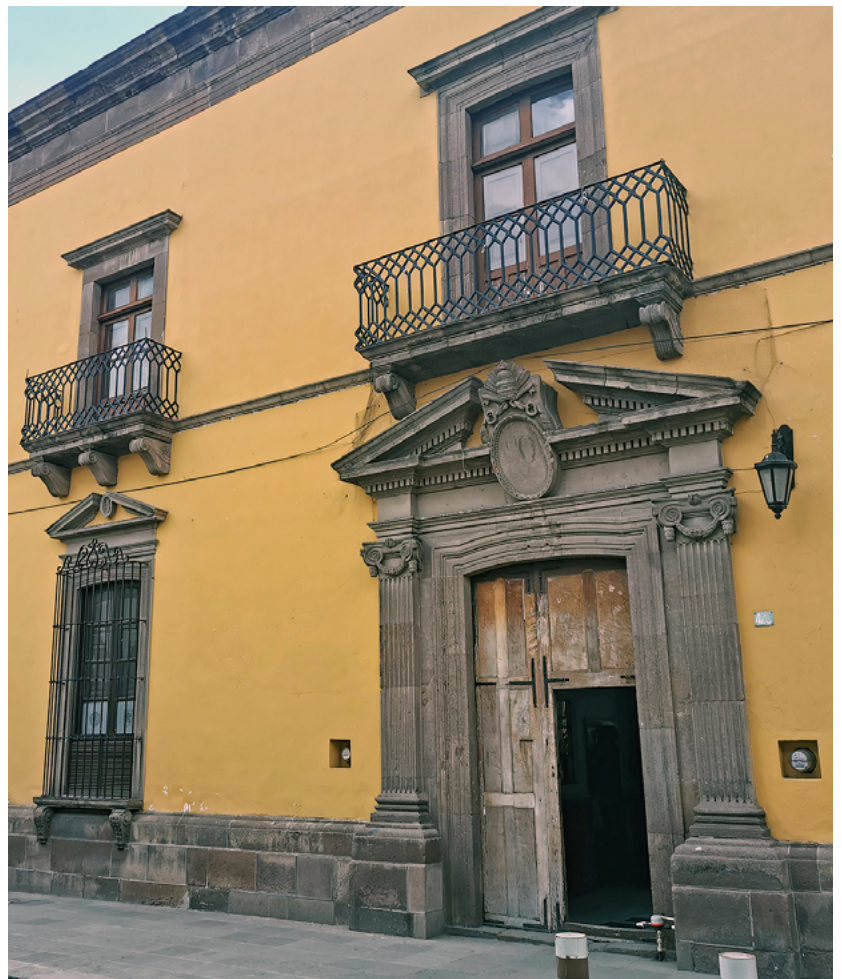
FIGURE 1. Facade of the property of Catholic Action, in the city of San Luis Potosí (Photograph: Amaranta González, 2021; courtesy: Biblioteca Ricardo B. Anaya, San Luis Potosí, Mexico).

The BRBA is unique in various ways since, although being sheltered in a property owned by the Archdiocese of San Luis Potosí, it is administered by the Círculo Cultural Ricardo B. Anaya, which is in full charge of its functioning. Regarding its finance, it relies on the donations of benefactors that every month make modest contributions for its maintenance (Figure 1).