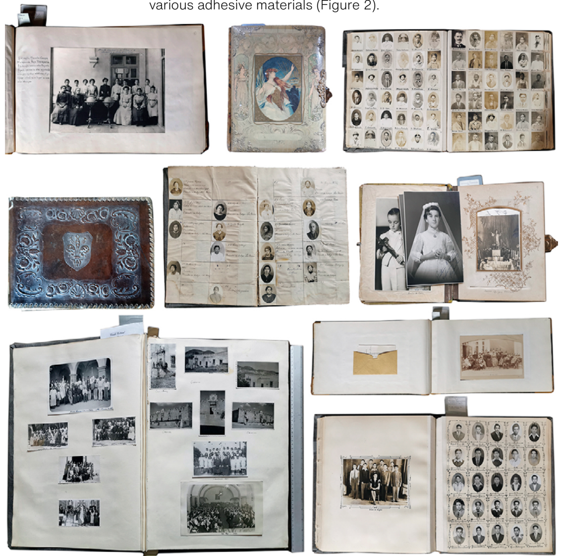
FIGURE 2. Sample of the diversity of photographic albums of the BRBA.

The bindings of the collection have different dimensions, covers and methods to hold the images; the photographic prints they contain also have different formats and technical nature, although most of them are printed images in black and white. In these albums, the photographs are associated with other raw materials, among which there are manuscript folios, drawn diagrams, printed documents, textiles, stamps, leather, celluloid, stylized papers, and various adhesive materials (Figure 2).