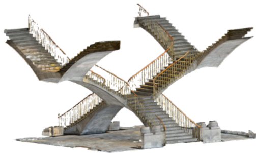
FIGURE 6. Staircase, MNH. 3D model elaborated by digital photogrammetry (Survey and model elaboration: Fabián Bernal Orozco Barrera, January 16, 2023; courtesy: Museo Nacional de Historia, CNMH).