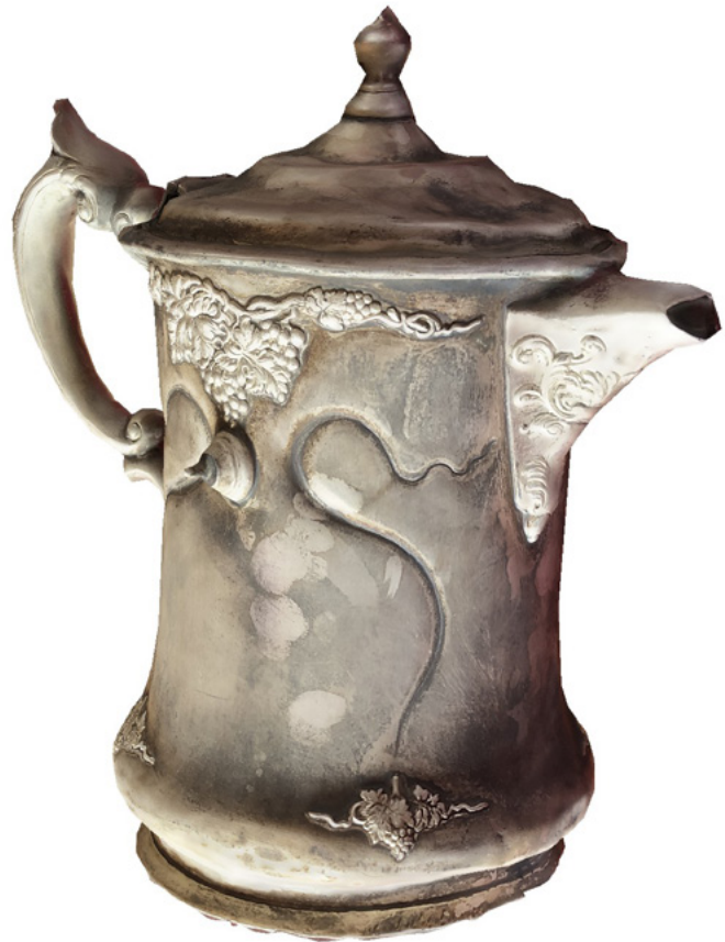
FIGURE 8. Samovar , MNH. 3D model elaborated by digital photogrammetry (Survey and model elaboration: Ángel Mora Flores, January 17, 2023; courtesy: Museo Nacional de Historia, CNMH).

It was also possible to conduct exercises to join interior and exterior 3D models in order to have a fully surveyed property or site. In addition, digital surveys were made using applications or Apps designed for cell phones with an ios operating system merely to explore the LiDAR sensor on iPhone Pro devices. There was a session to export the Agisoft Metashape 2.0 point cloud to AutoCAD using Autodesk ReCap as a means between those two programs in order to draw plans.