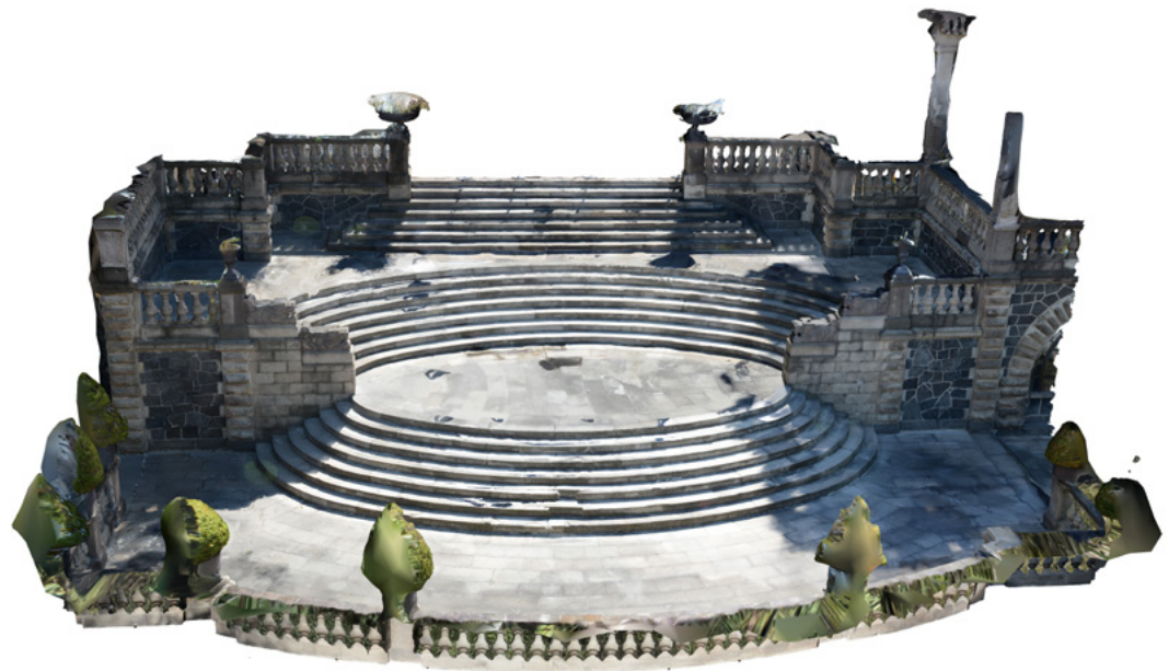
FIGURE 4. Staircase of the Jardín de las Pérgolas, MNH. 3D model elaborated by digital photogrammetry (Survey and elaboration of the model: Áyax Horacio Segura Galván, January 14, 2023; courtesy: Museo Nacional de Historia, CNMH).