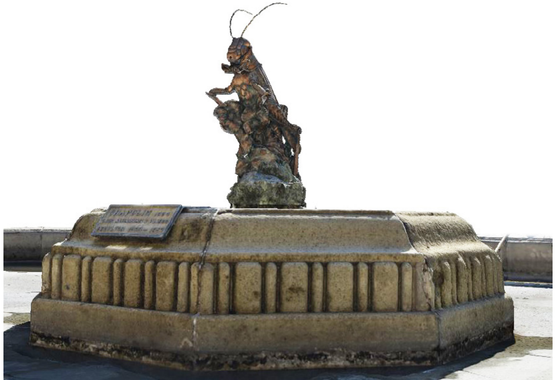
FIGURE 5. Fuente del Chapulín , Alcazar of the MNH. 3D model elaborated by digital photogrammetry (Survey and model elaboration: Emanuel Herrera Dávila, January 16, 2023).