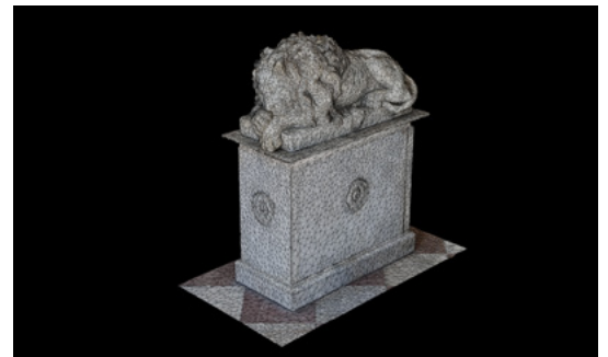
FIGURE 7. Image of the textured mesh in the Escalinata de los Leones , Alcazar of the MNH. 3D model elaborated by digital photogrammetry (Survey and model elaboration: María Sánchez Vega, January 16, 2023).