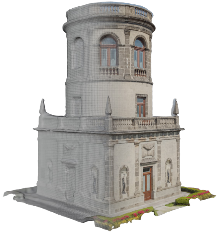
FIGURE 3. Caballero Alto , MNH. 3D model elaborated by digital photogrammetry (Survey and model elaboration: Marisela González Quiroz, January 12, 2023).