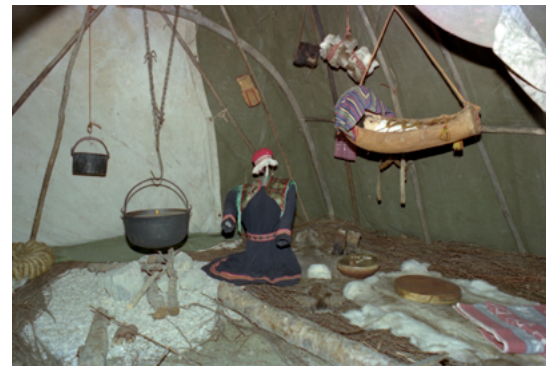
FIGURE 2. Staging of a tent inhabited by a Sami woman, crib and belongings in the Laplanders Hall (Source: Photo Library of the MNCM, 2020; courtesy: Secretaría de Cultura- INAH-Museo Nacional de las Culturas del Mundo-MEX; Reproduction Authorized by the Instituto Nacional de Antropología e Historia).