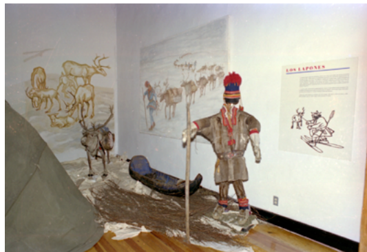
FIGURE 1. Male gákti , sleigh and reindeer in the Laplander's Hall, of the Museo Nacional de las Culturas (Source: Photo Library of the MNCM, 2020; courtesy: Secretaría de Cultura- INAH-Museo Nacional de las Culturas del Mundo-MEX; Reproduction Authorized by the Instituto Nacional de Antropología e Historia).

It is worth mentioning that the Laplanders Hall ( Sala de los Lapones ) is the precedent of the current exhibition. This was one of the permanent exhibitions with which the MNCM was inaugurated in 1965, and which remained active until the beginning of this century. From a museographic point of view, the Laplanders Hall contained a staging composed of a taxidermy reindeer ( Rangifer tarandus ) sample, which sought to highlight the importance of herding in said culture. In addition, there was a sleigh and a male costume made of reindeer skin (Figure 1). These elements were found next to a tent inhabited by the costume of a Sami woman, a figure surrounded by everyday objects (a reindeer skin bag, two metal pots, a ceremonial drum, among others) and a cradle (Figure 2).