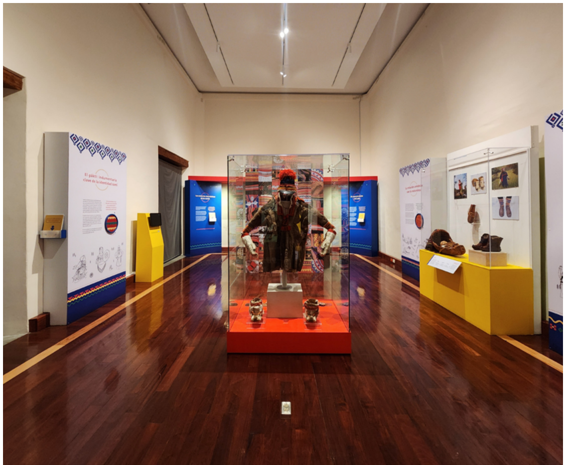
FIGURE 6. View of the completed Sami People's Hall (Photograph: Celeste Jardinez, 2023; courtesy: Celeste Jardinez).